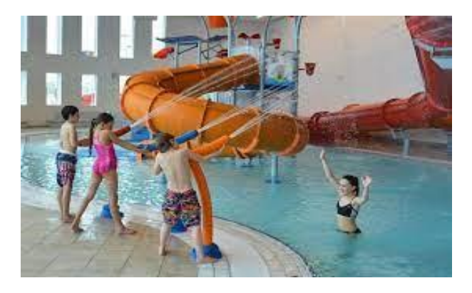
The Leisure Centre

Bridlington Spa is certainly worth a visit, with shows, events, craft fairs, movies and much more. Visit bridspa.com for information.